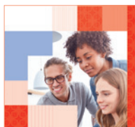
EUROPE jury € 2 550*

These specific fees for the recruitment and the insertion of the candidates selected by the jury into the International Sections are to be paid once for the 5 years of the engineering cursus. These amounts include the special summer school as well as accommodation and food costs until August, 31, 2025. An invoice will be sent to you to allow you to pay for them.