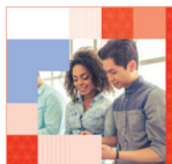
Asia, Latin America, Caribbean and other countries of the word juries € 5 350*