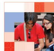
Double degree AMERINSA € 3 100*

Please complete the bank transfer before June 30th, 2025; otherwise, your administrative registration cannot be finalized.